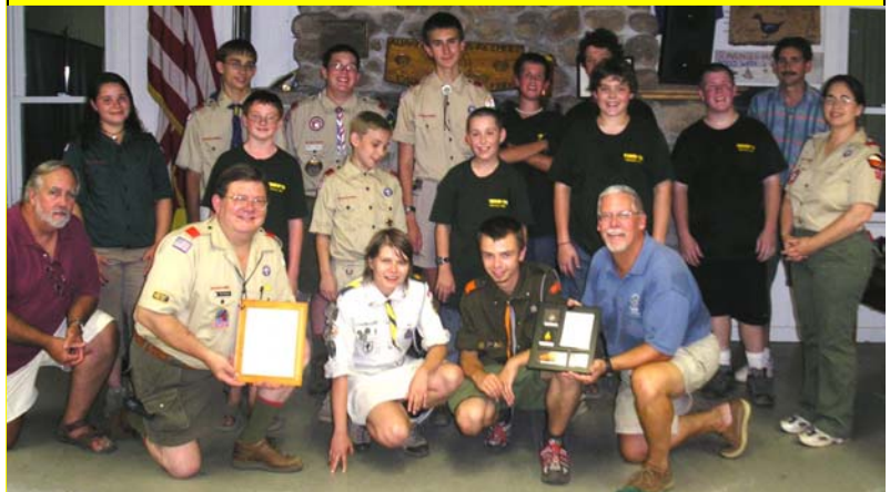
A small, but important, part of the World Brotherhood of Scouting.