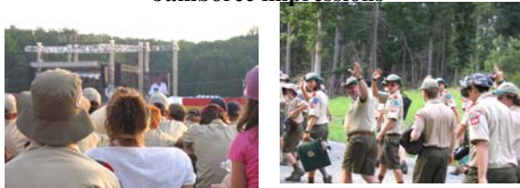
President Bush addresses the Scouts. Troop 108 headed for arena.

Heard from one of our Sandwich Scouts: "It is very fun; there is a lot to do and trading patches is awesome," Favorite activities at the jamboree ranged from trapshooting to scuba diving. Many scouts are working to earn "Rockers," patches that show a person has completed a certain activity.